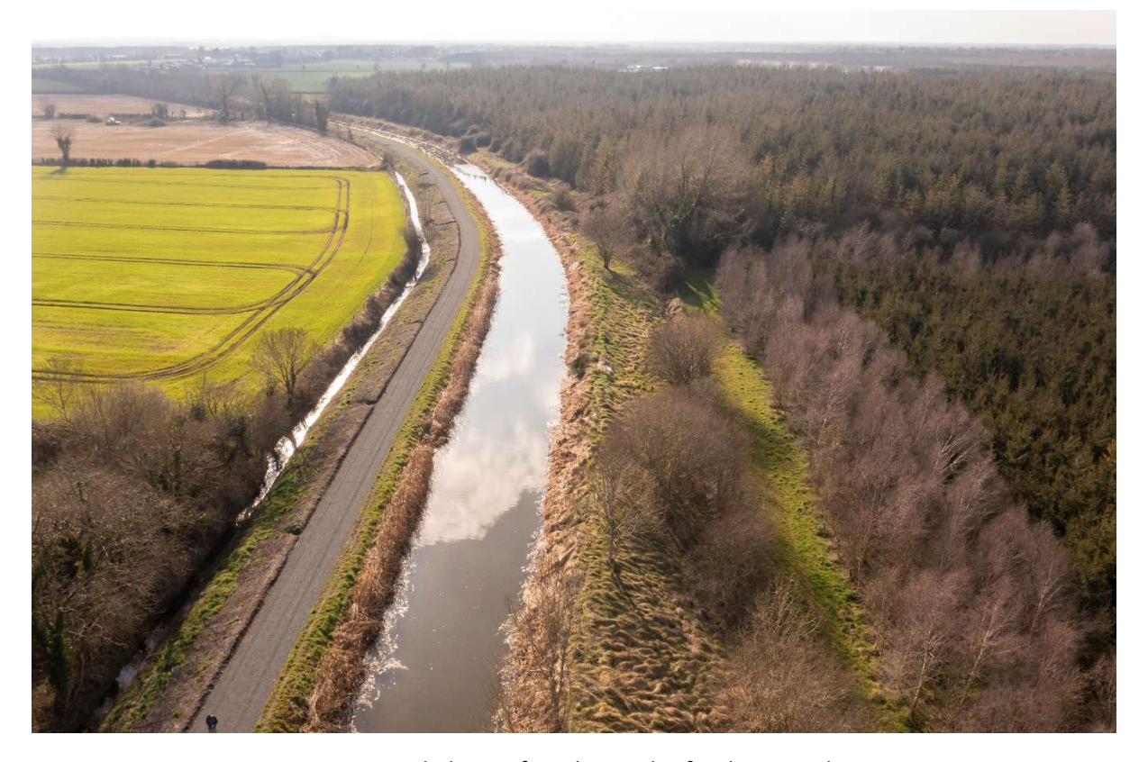
Fig 1 – Aerial photo of works south of Wilsons Bridge

This section of the project required re-profiling of long sections of the embankment to provide a level surface for the blueway installation. Progress was slower than initially intended, however the works are now complete in this section of the works bank has been re-opened for public use.